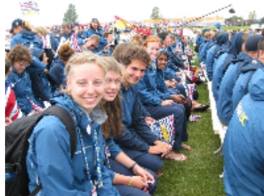
A few familiar Team BC faces shine out from the Closing Ceremonies