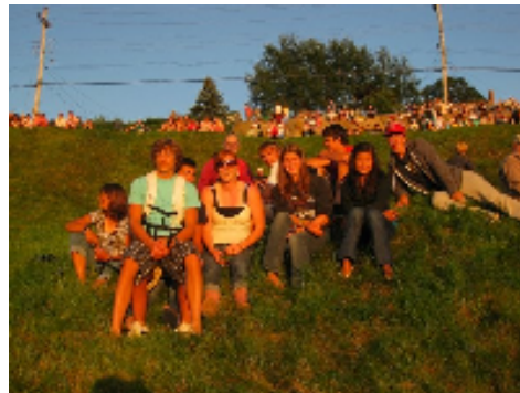
Team BC athletes at the Opening Ceremonies at The World Canoe & Kayak Championships