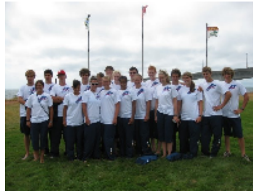
Team BC poses at Prince Edward Island